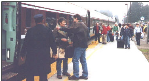
Amtrak Cascades train 506 boards passengers at Olympia-Lacey's Centennial Station on Dec. 10. Many WashARPer's from the north used Amtrak to travel to and from that day's meeting and holiday party, held in the station.

While much fruit is ready for the picking, he also urged patience. "You're going to get turned down a couple of times before (See Workshop , page 4)