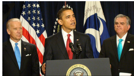
President Barack Obama, flanked by Vice President Joe Biden, on left, and USDOT Secretary Ray LaHood, presented his Administration's vision for the development of high speed rail in the United States at an April 16 press conference.

"What we're talking about is a vision for high speed rail in America. Imagine boarding a train in the center of a city. No racing to an airport and across a terminal, no delays, no sitting on the tarmac, no lost luggage, no taking off your shoes. Imagine whisking through towns at speeds over 100 miles an hour, walking only a few steps to public transportation, and ending up just blocks from your destination. Imagine what a great project that would be to