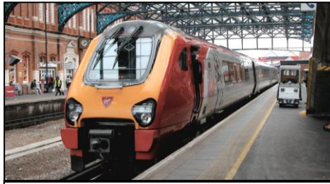
Virgin Voyager DMU train at Bourne-mouth, England.

Speed was a real surprise in the UK – trains were often not all that fast, other than on the 100 mph plus express main lines.