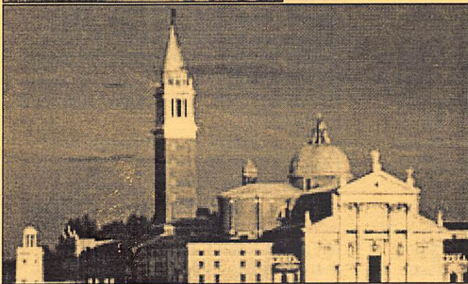
Top, King St. Station with the Seattle skyline; bottom, the campanile at Piazza San Marcos in Venice, Italy from which the King St. Station tower was modeled. The campanile was built in 1173, King St. Station in 1906.